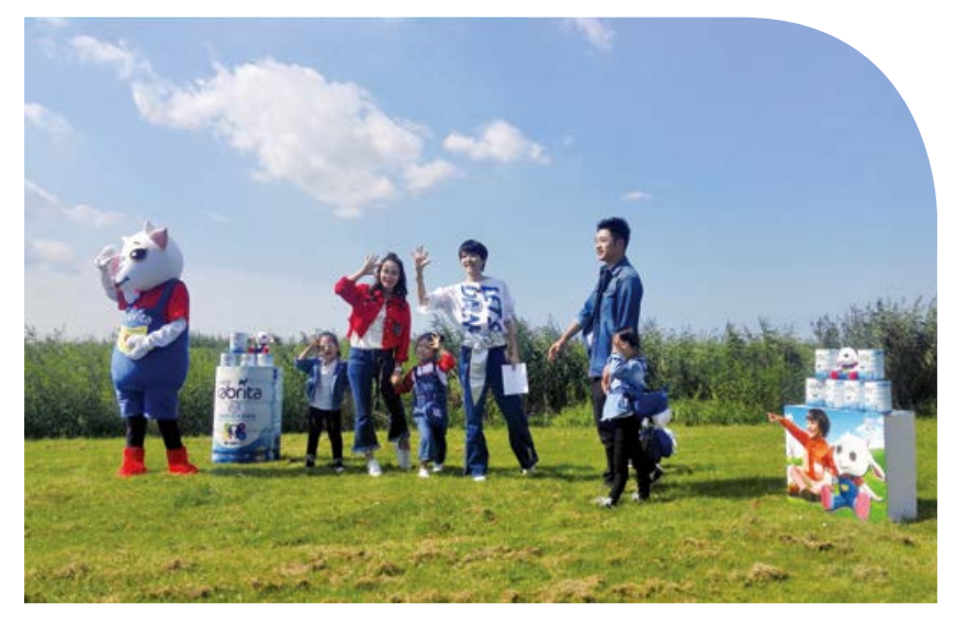
"Show Your Baby" featured Kabrita's goat farms and manufacturing processes in the Netherlands

Ausnutria provides standard Holland Tours in the Netherlands as an educational program to promote Dutch goat milk. The tours are open for all product distributors, aiming to demonstrate the manufacturing processes of goat milk infant formula and to share information about the Dutch goat dairy industry from a broader perspective. Ausnutria has also cooperated with Aniworld TV (金鷹卡通) to launch a TV program in the PRC called "Show Your Baby (愛寶 貝曬一曬)" under Kabrita since 2016, with an annual episode featuring children from the PRC participating in the Holland Tour. As many customers in the PRC are unfamiliar with goat milk products, the program features Kabrita 's goat farms and production facilities to improve their understanding of Dutch goat milk products.