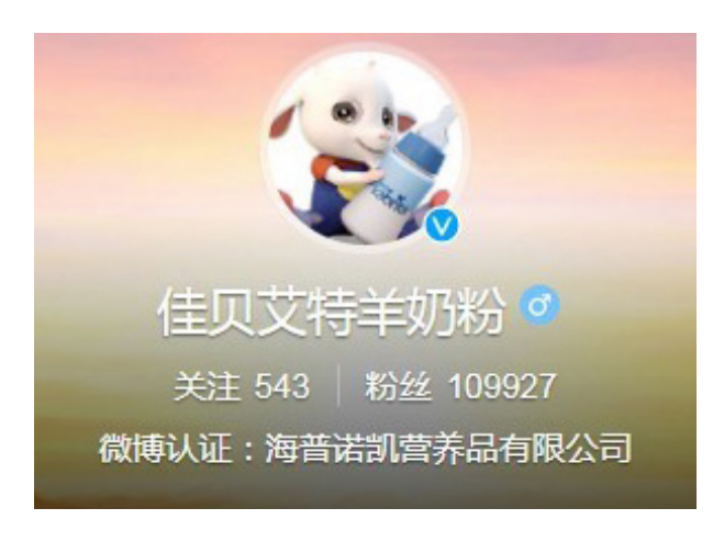
Weibo platforms of the Group's major dairy brands