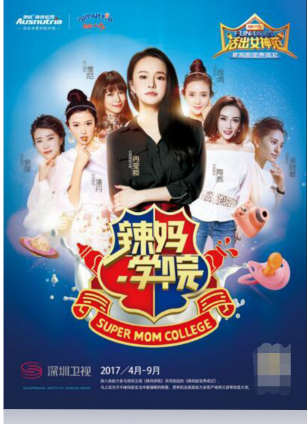
The "Nurturing Super Moms and Talented Kids (辣媽能寶養成記)" event in 2017